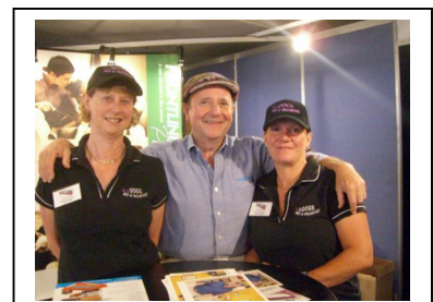
Look who we met!